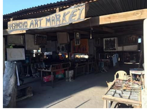
Figure 4: Curio shop (Bagamoyo Art Market).