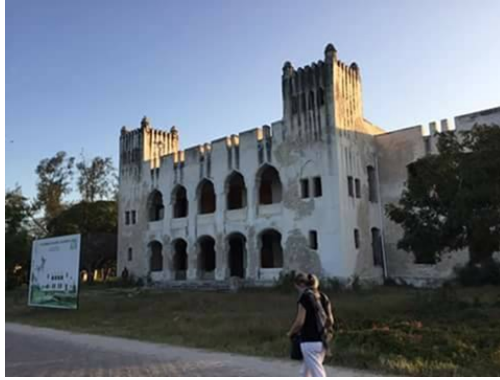
Figure 3: The Germany Boma.