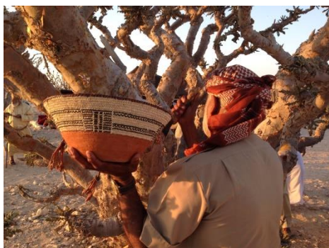
Frankincense tree.

The frankincense trees of Wadi Dawkah and the remains of the caravan oasis of Shisr/Wubar and the affiliated ports of Khor Rori and Al-Baleed vividly illustrate the trade in frankincense that flourished in this region for many centuries, as one of the most important trading activities of the ancient and medieval world.