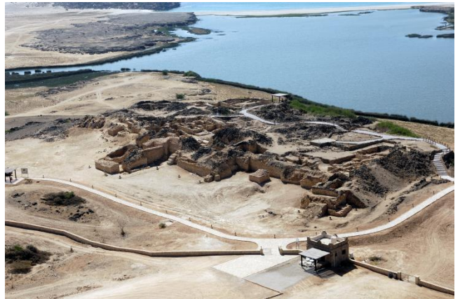
Land of Frankincense, Port of Sumhuram.

Please check our website and blog for updates on registration, submitting abstracts, and details for accommodations and travel.