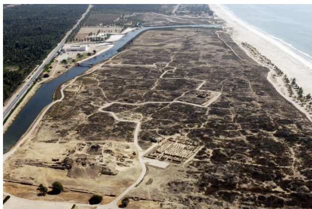
AL Baleed Archaeological Site

The Rotana Hotel Resort offers a special package for our conference delegates including lodging and 2 meals (breakfast and dinner) a day for 50 OMR ($130) per day. This package can be booked directly at the hotel via this booking form .