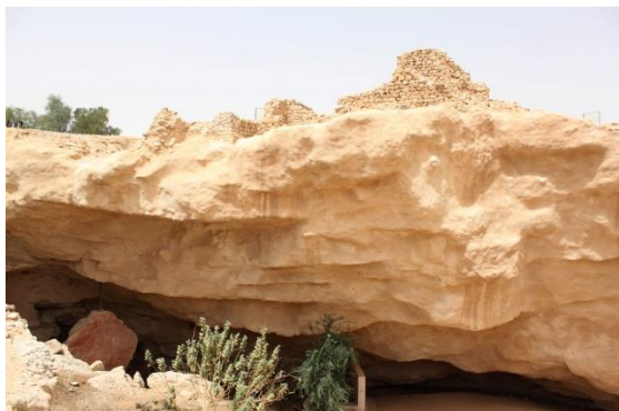
Wubar Archaeological Site

Although membership in ICAHM is not required to present an abstract or poster in this conference, we strongly encourage participants to join ICAHM .