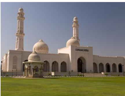
Sultan Qaboos Mosque, Salalah

The Rotana Hotel Resort, where the conference is held, is offering a special package for 50 OMR (130$) a day including lodging and 2 meals (breakfast and dinner). Please click here for the reservation form.