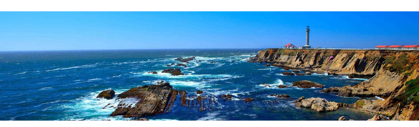
More information and booking: http://icahm.icomos.org/chile-post-conference-tours/